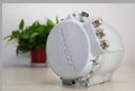
Electric traction motor