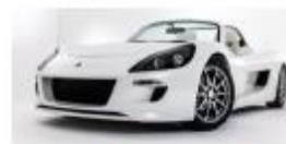
Electric sports car