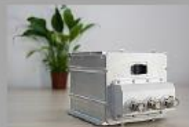
Drive control unit